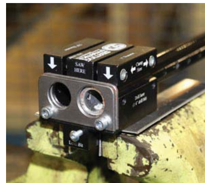
Step 6 after cutting