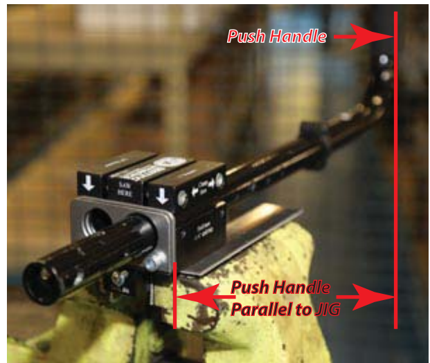
Steps 1 - 5